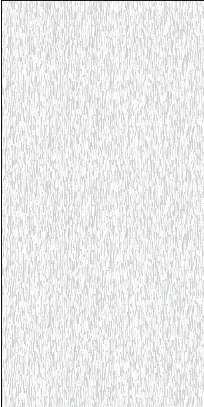
FULL SHEET PATTERN ORIENTATION

NOTE: THE ABOVE ILLUSTRATION IS FOR ORIENTATION ONLY. ACTUAL PATTERN MAY VARY FROM PATTERN SHOWN.