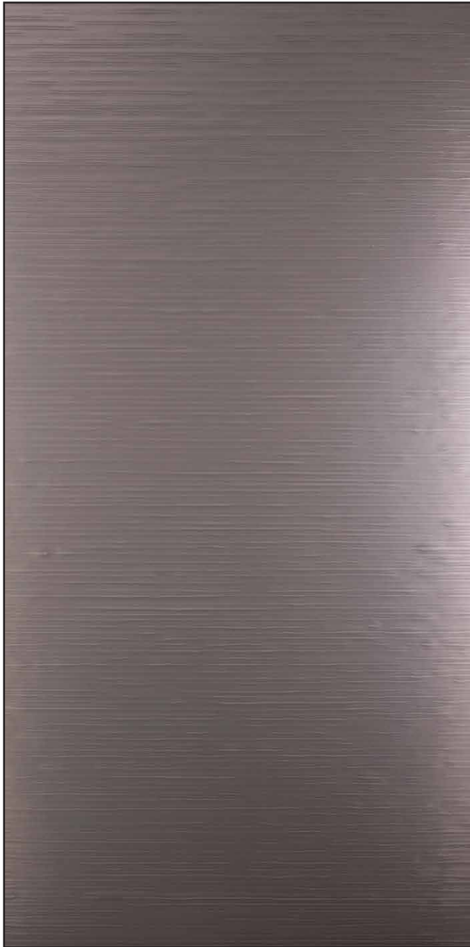
FULL SHEET PATTERN ORIENTATION

NOTE: THE ABOVE ILLUSTRATION IS FOR ORIENTATION ONLY. ACTUAL PATTERN MAY VARY FROM PATTERN SHOWN.