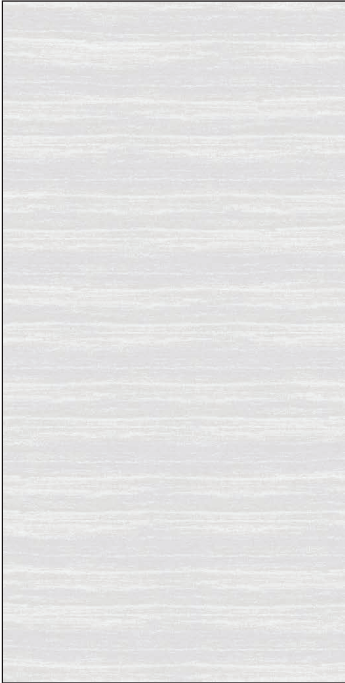
FULL SHEET PATTERN ORIENTATION

NOTE: THE ABOVE ILLUSTRATION IS FOR ORIENTATION ONLY. ACTUAL PATTERN MAY VARY FROM PATTERN SHOWN.