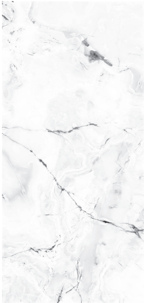
WHITE ONYX A-1

ViviStone White Onyx is available in four slab options. The size as shown for each slab is 48" x 102", but smaller sections can be specified if desired. The ViviStone Virtual Quarry allows you to select from our collection of ViviStone slabs, assemble and configure a design to meet your project needs, and save your work to return to at any time. To get started visit www.forms-surfaces.com , or to access the Virtual Quarry directly go to www.virtualquarry.com .