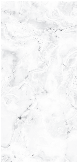
WHITE ONYX A-4