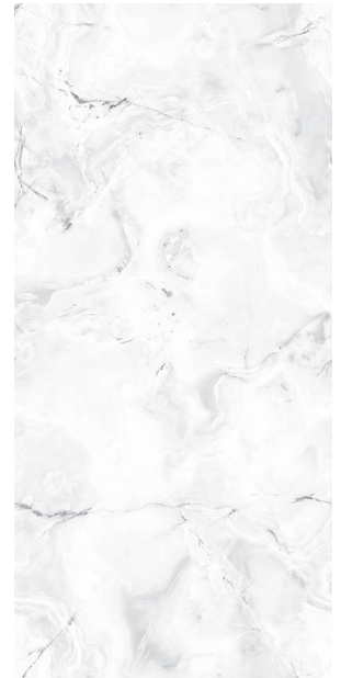
WHITE ONYX A-3