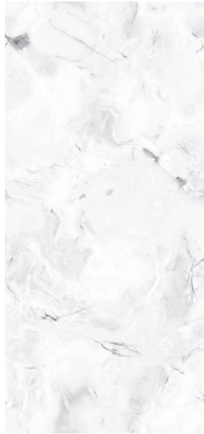
WHITE ONYX A-2