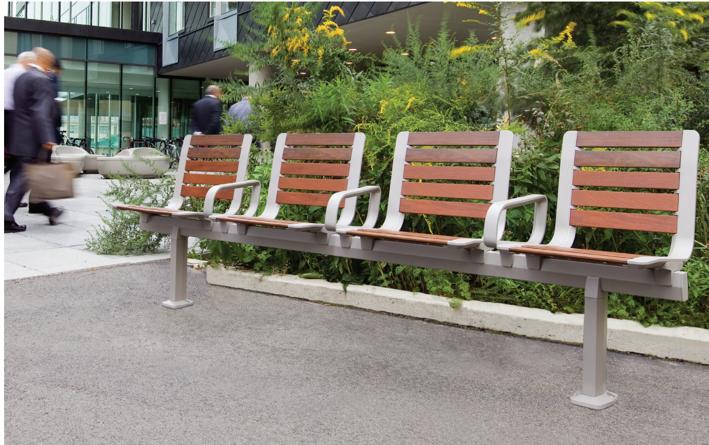
Four-seat configuration with FSC® 100% Ipé hardwood slat seats (extruded aluminum slats shown on cover)

Installation: freestanding or surface mount; can be linked for continuous runs