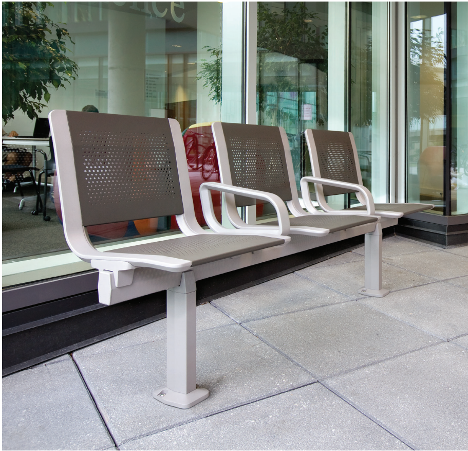
Three-seat configuration with perforated stainless steel seats