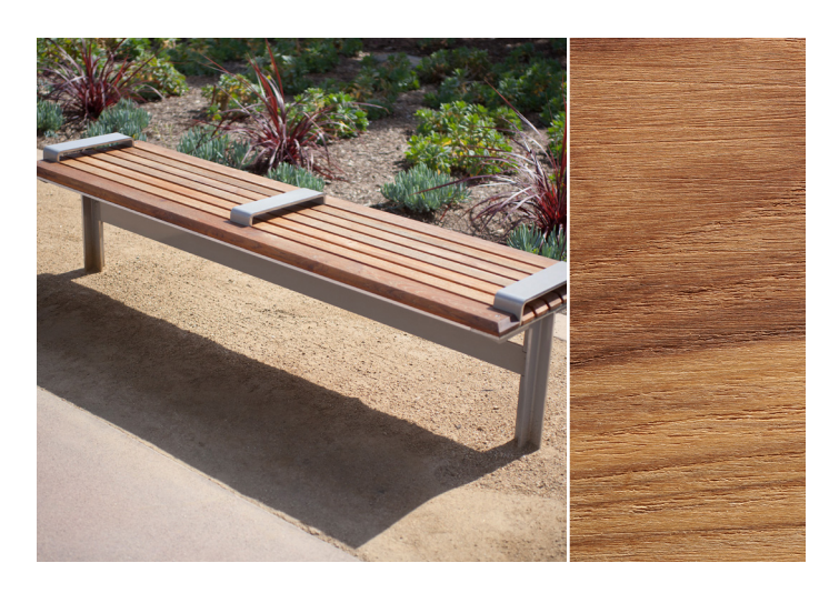
FSC 100% Teak rates 1070 on the Janka hardness scale. The wood's color ranges from deep brown to golden or medium brown.