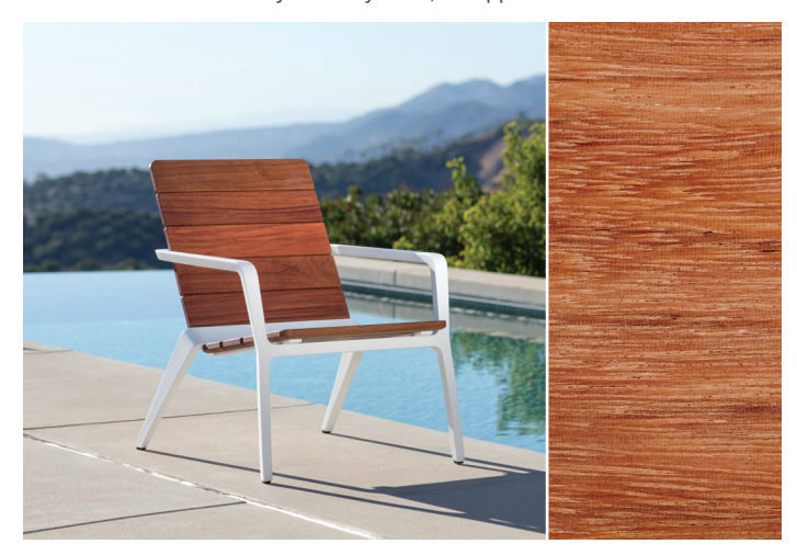
FSC 100% Cumaru —aka Brazilian Teak—rates 3330 on the Janka hardness scale and is a top F+S performer with outstanding weatherability. The color ranges from medium to dark brown and can have a reddish or purplish hue. Occasionally, yellow or greenish brown streaks occur.

The FSC 100% rating means that all wood designated FSC 100% is harvested from forests that are legally run, environmentally sustainable, have a long-term management plan, and are socially responsible to their local communities. Yearly audits and recertifications ensure that our products and suppliers are in full compliance with the FSC 100% designation. Our relationship with our supplier and growers is now 15 years strong and extends all the way to the plantations. Built on trust and visibility at every level, it supports our continued confidence that the woods we use in our products are of responsible origin.