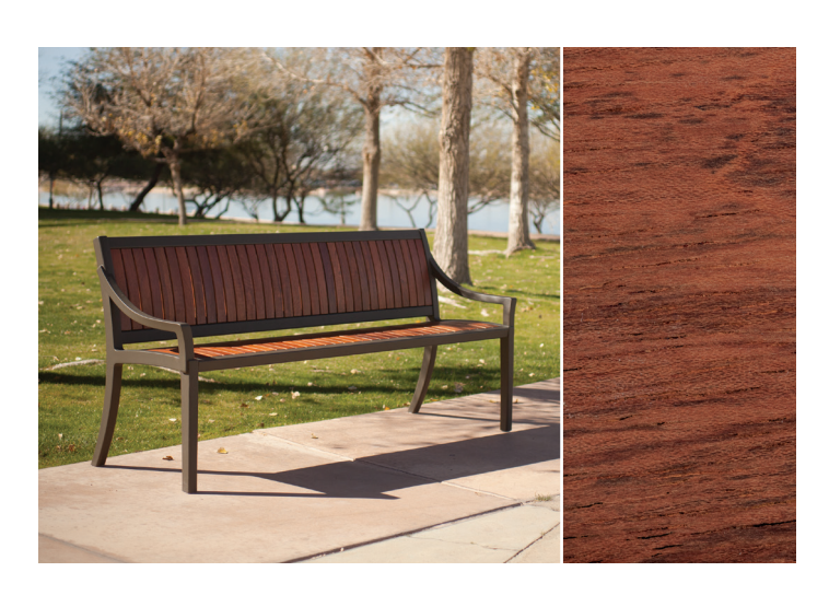
FSC 100% Jatoba —aka Brazilian Cherry—rates 2350 on the Janka hardness scale and can vary in color from a rich tan to a deep red.