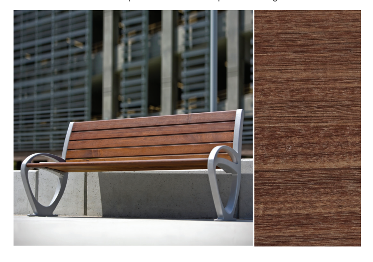
FSC 100% Ipé —aka Brazilian Walnut—the hardest of our hardwoods, rates 3684 on the Janka hardness scale (for comparison, Kebony rates 1619 and Jarrah, 1910). The color ranges from amber to burnt sienna.