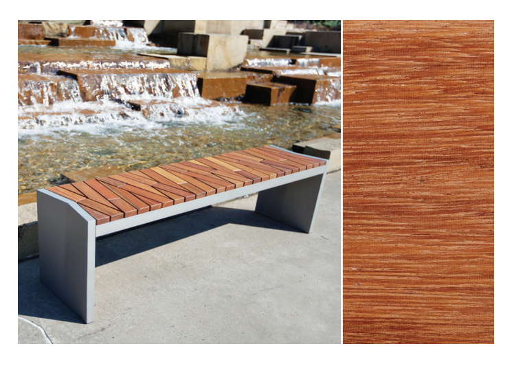
FSC Recycled 100% Cumaru is a beautiful hardwood repurposed from renovation projects. Bringing a bit of the past to the present, the color can vary from amber to burnt sienna.