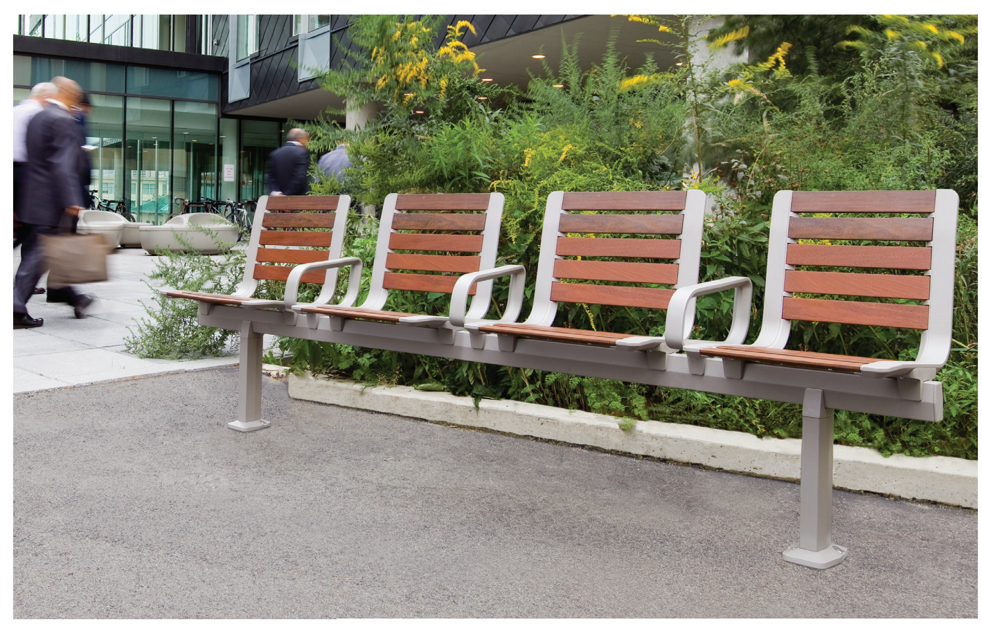
Four-seat configuration with FSC® 100% lpé hardwood slat seats (extruded aluminum slats shown on cover)