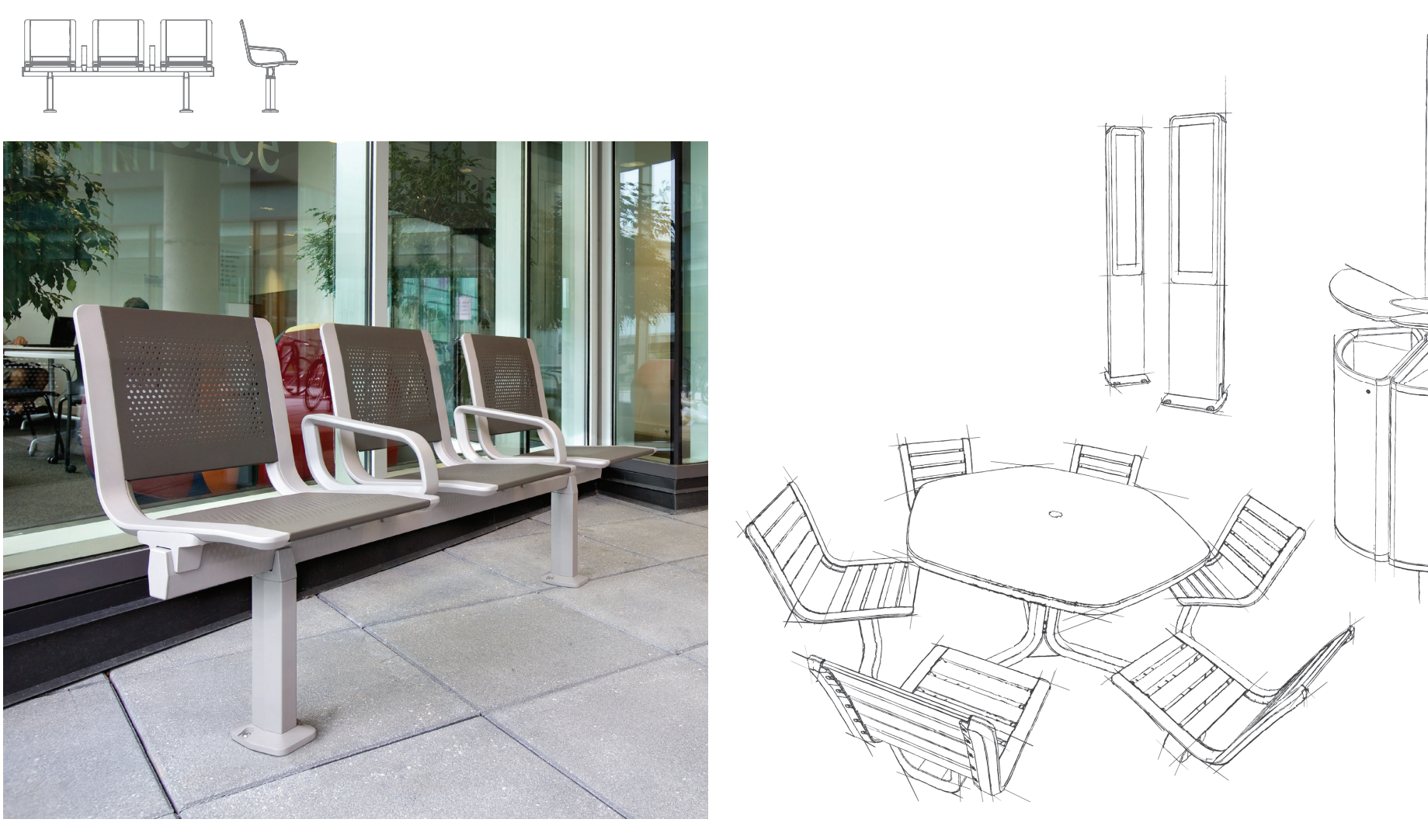
Three-seat configuration with perforated stainless steel seats