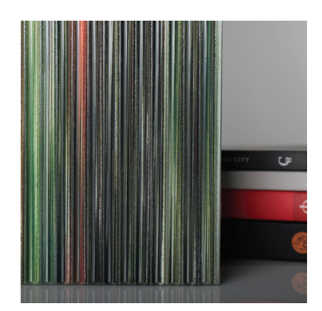
\mathsf{CORDUROY}^{\scriptscriptstyle\mathsf{TM}} + \mathsf{CAPRICE}^{\scriptscriptstyle\mathsf{TM}}

All designs shown below can be specified in both horizontal and vertical orientations.