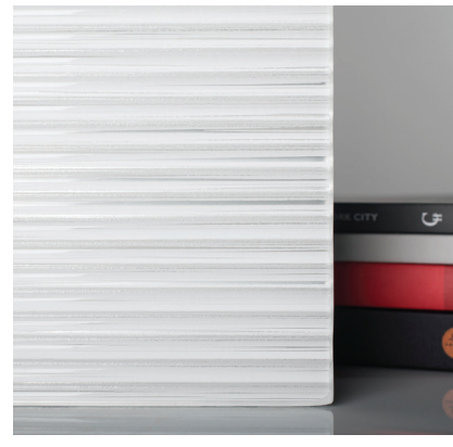
\mathsf{CORDUROY} + \mathsf{SHIMMER}^{\mathsf{TM}}