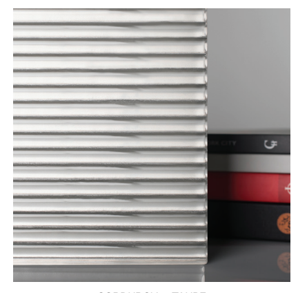
\mathsf{CORDUROY} + \mathsf{TAUPE}