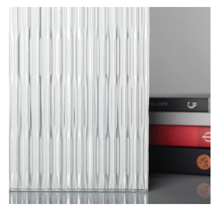
CORDUROY + SWITCHBACKS™