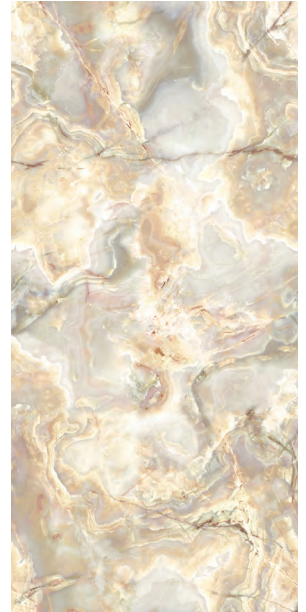
OPAL ONYX A-3