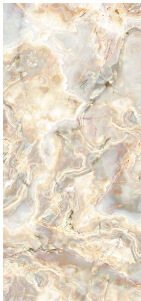
OPAL ONYX A-4