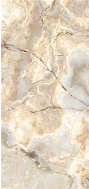
OPAL ONYX A-1

ViviStone Opal Onyx is available in four slab options. The size as shown for each slab is 48" x 102", but smaller sections can be specified if desired. The ViviStone Virtual Quarry allows you to select from our collection of ViviStone slabs, assemble and configure a design to meet your project needs, and save your work to return to at any time. To get started visit www.forms-surfaces.com , or to access the Virtual Quarry directly go to www.virtualquarry.com .