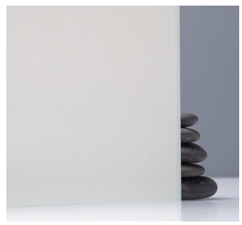
\begin{array}{c} \text{UNDERSTITCH}^{\scriptscriptstyle\mathsf{TM}} \\ \text{White} \end{array}