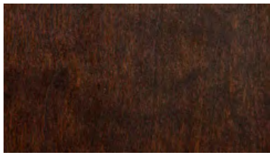
AMERICAN CHERRY W/ DARK MAHOGANY STAIN