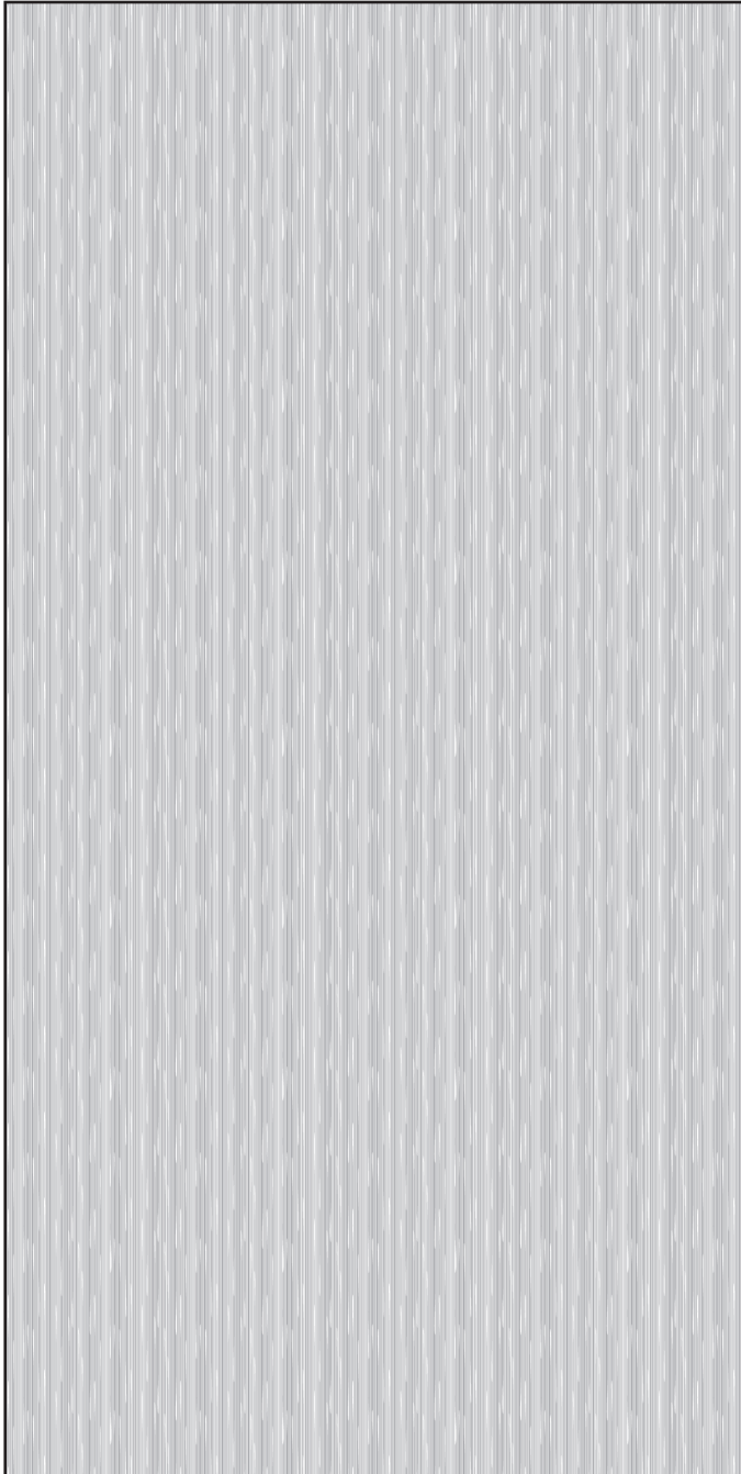
FULL SHEET PATTERN ORIENTATION

NOTE: THE ABOVE ILLUSTRATION IS FOR ORIENTATION ONLY. ACTUAL PATTERN MAY VARY FROM PATTERN SHOWN.