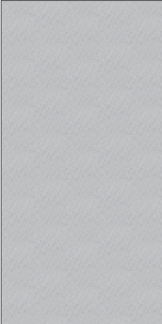
FULL SHEET PATTERN ORIENTATION - GREY AREAS ARE ETCHED

NOTE: THE ABOVE ILLUSTRATION IS FOR ORIENTATION ONLY. ACTUAL PATTERN MAY VARY FROM PATTERN SHOWN.