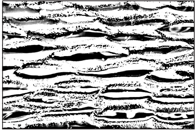
TEXTURE DETAIL 1:1

NOTE: THE ABOVE ILLUSTRATION IS FOR ORIENTATION ONLY. ACTUAL PATTERN MAY VARY FROM PATTERN SHOWN.