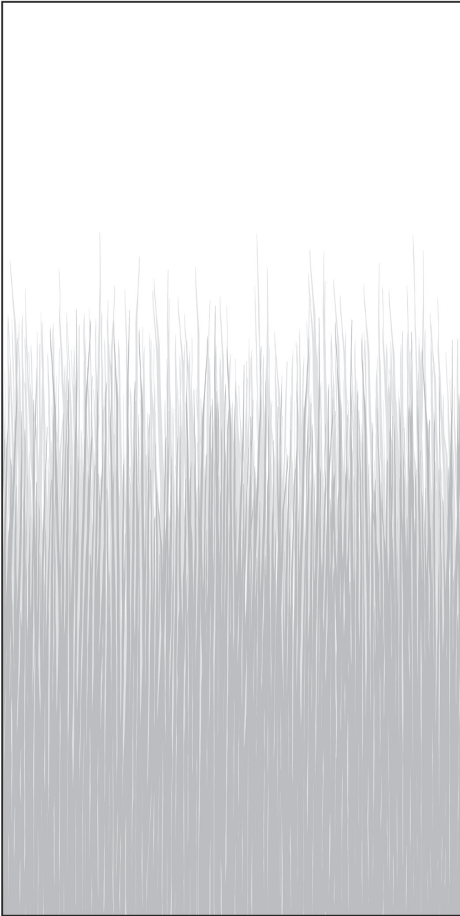
FULL SHEET PATTERN ORIENTATION