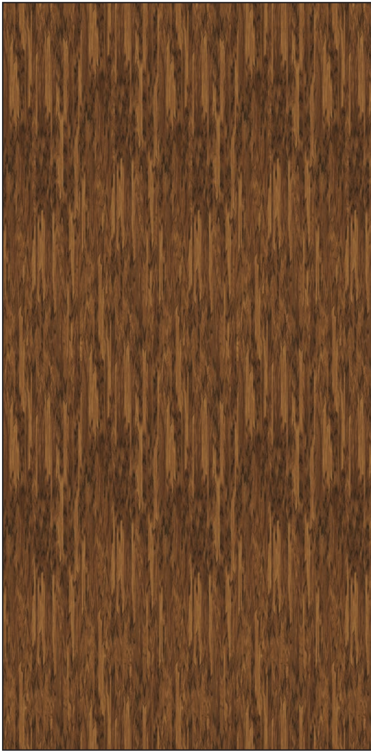
FULL SHEET PATTERN ORIENTATION