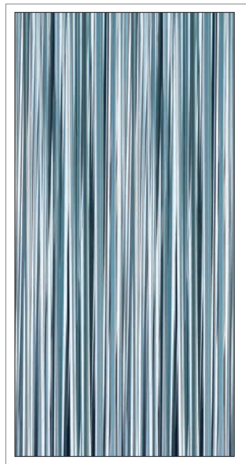
FULL SHEET PATTERN ORIENTATION