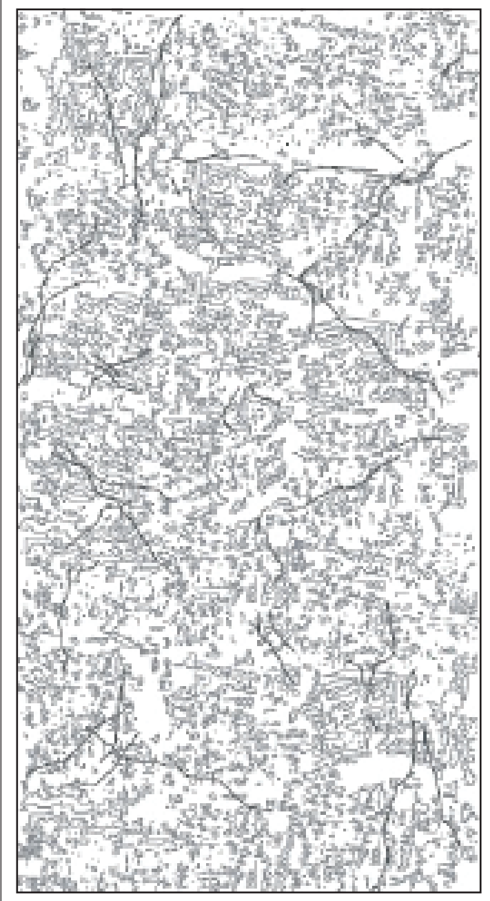
FULL SHEET PATTERN ORIENTATION

NOTE: THE ABOVE ILLUSTRATION IS FOR ORIENTATION ONLY. ACTUAL PATTERN MAY VARY FROM PATTERN SHOWN.