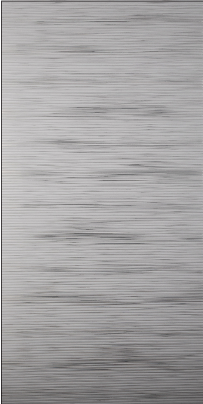
FULL SHEET PATTERN ORIENTATION

NOTE: THE ABOVE ILLUSTRATION IS FOR ORIENTATION ONLY. ACTUAL PATTERN MAY VARY FROM PATTERN SHOWN.